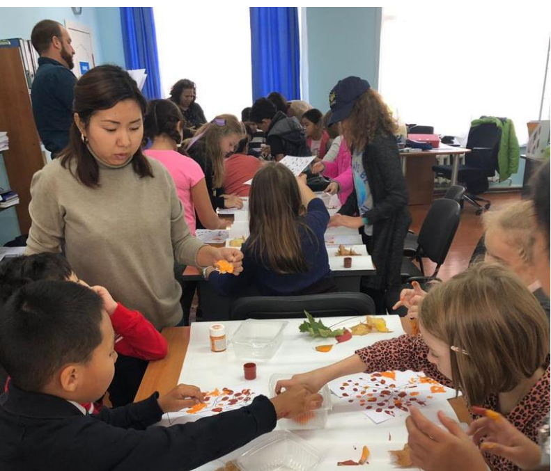
P5 students and teachers

Hand In Hand was very thankful to BIS for their contribution of funds raised at Art and Poetry Night last spring, and to the Primary 5 families for their donation of art supplies to the school.