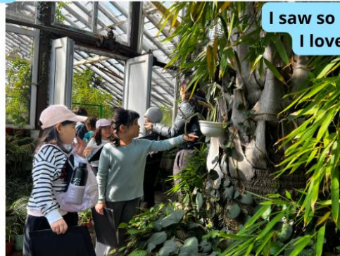
I saw so many plants in the Botanical Garden. I love that place. I saw a bamboo tree. Tabiiat