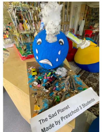
The Sad Planet Made by Preschool 3 Students