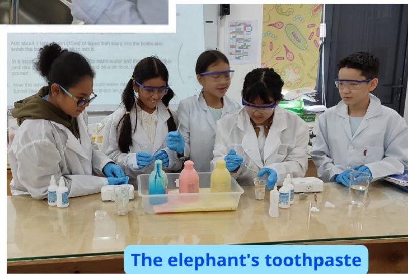
The elephant's toothpaste