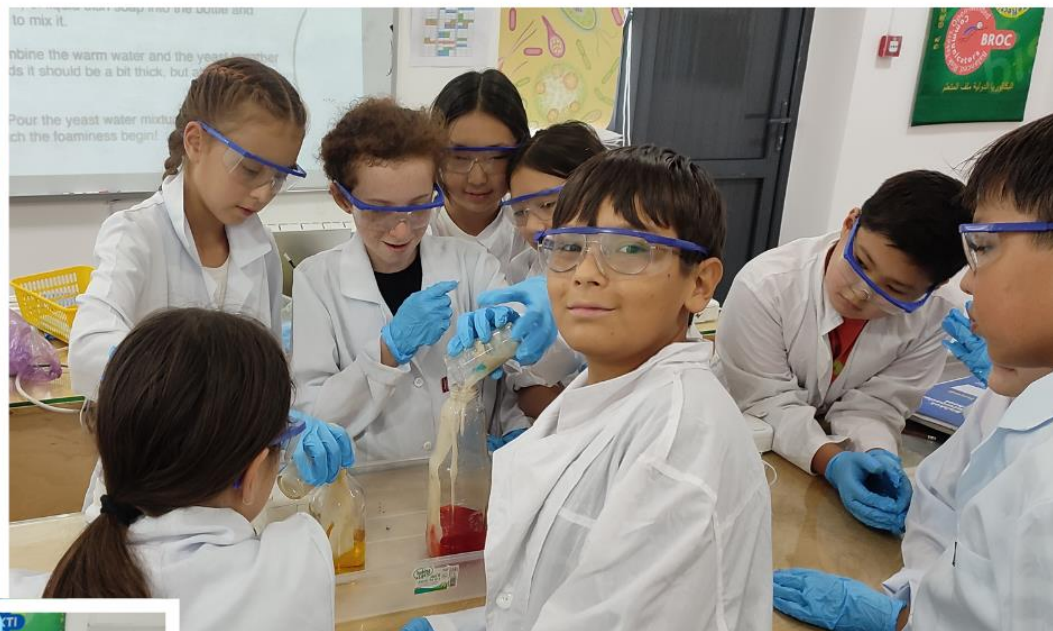
Fantastic foamy fountain