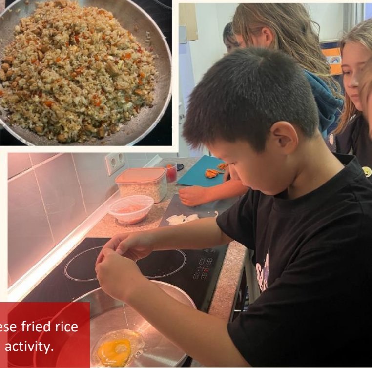
During Mandarin class, Grades 4 and 5 students cooked Chinese fried rice together, embracing Chinese culinary traditions as a delightful activity.