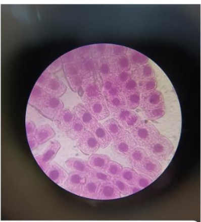
Mitosis in garlic root tip under the microscope.