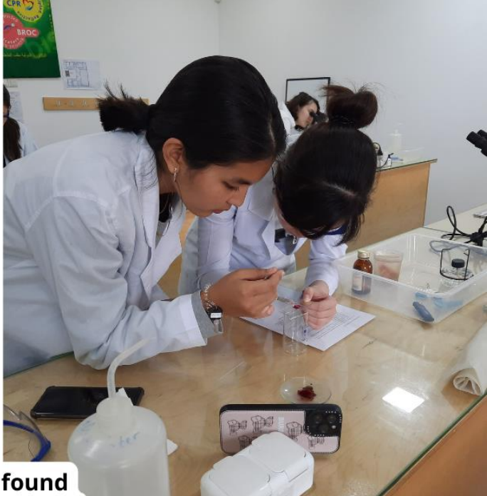
During Biology experiment grade 11 students found mitosis phases of cell division under the microscope.