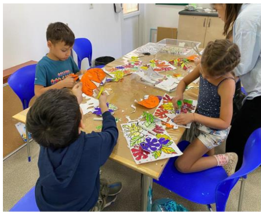
Making autumn foxes in Creative Art ECA