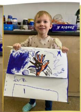
Students making a handbag design