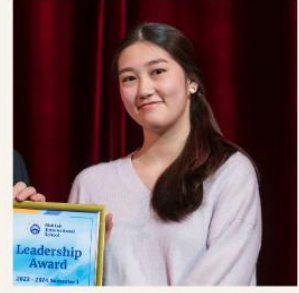
Jannat Almazbek High School