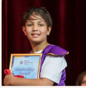
Saamik Nadol Primary School