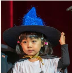
Anzu Nakazawa Preschool