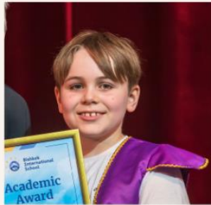
Sasha Gerry Primary School