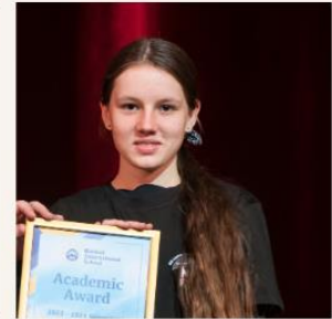
Laure Nogues High School