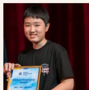
Sanghoon Yi Middle School