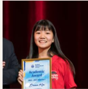
Daeun Kim Middle School