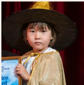
Myangan-Od Enkhtaivan Preschool