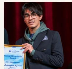
Muhammad Kumail Hasan High School