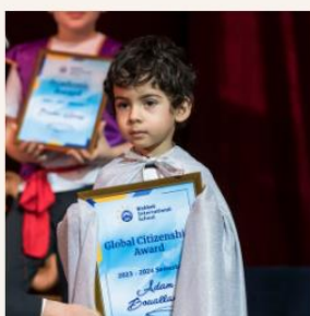
Adam Bouallaoui Preschool