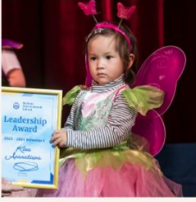
Kira Asanalieva Preschool