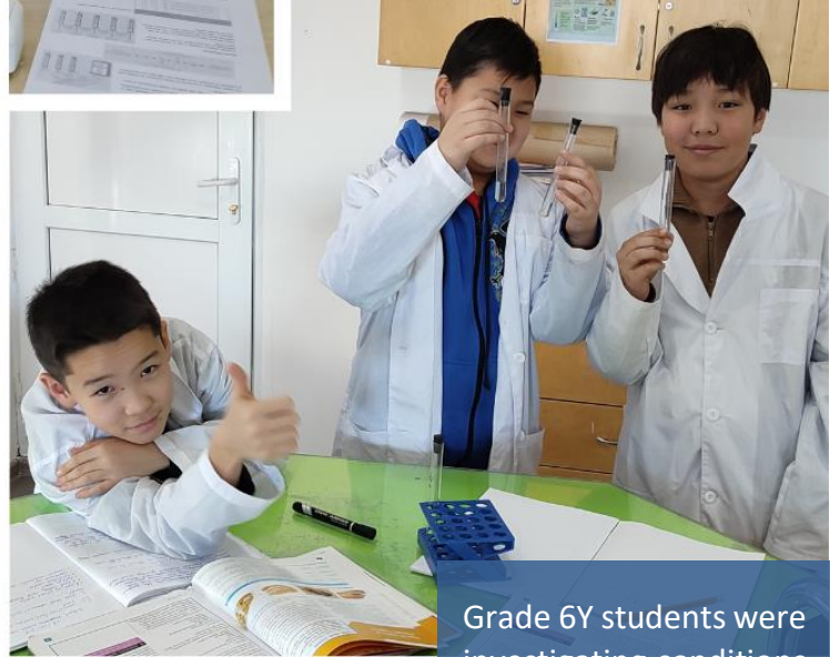
Grade 6Y students were investigating conditions that causes rusting.