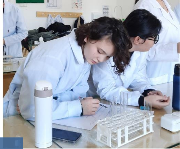
Quantitative Benedict's test in Grade 11