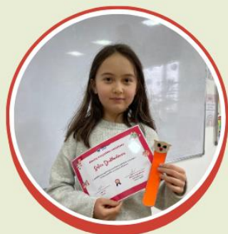
Safiia G5B / Ayla G5Y