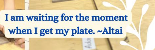
I am waiting for the moment when I get my plate. ~Altai